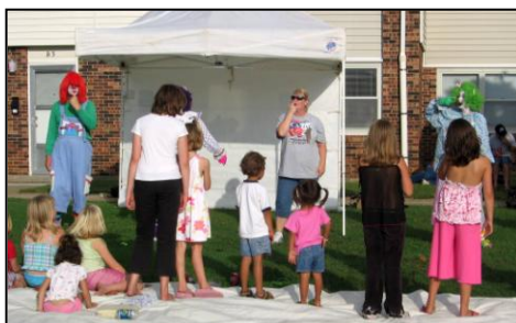
Clowns teaching new songs