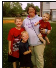
GINGER & KIDS