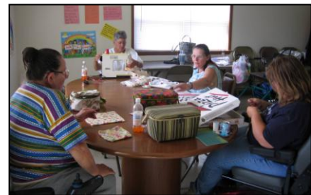
"Craft and Gab"